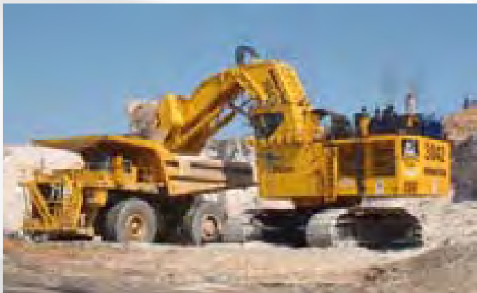
应用范例：挖掘机 Application example: Excavator