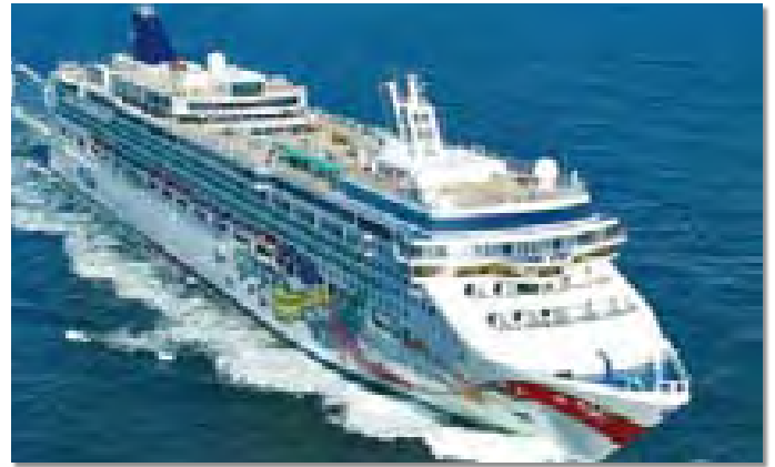
应用范例：海运 Application example: Marine