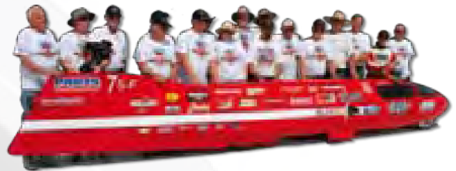
应用范例：赛车引擎测试台 Application example: Racing engine test bench