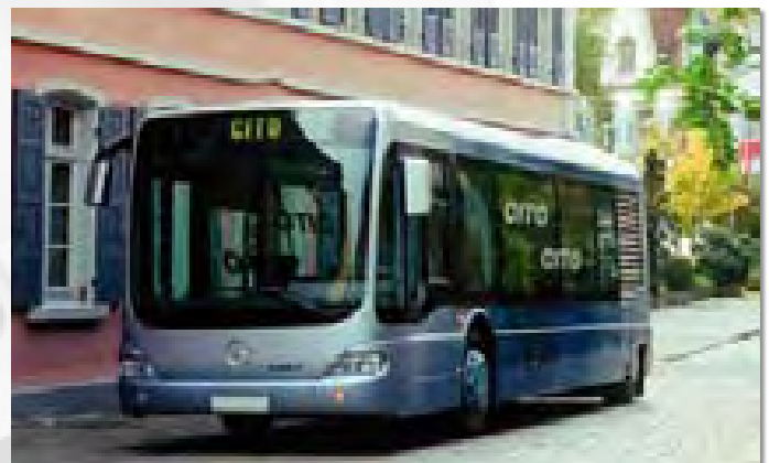
应用范例：机动技术 Application example: Mobile technology